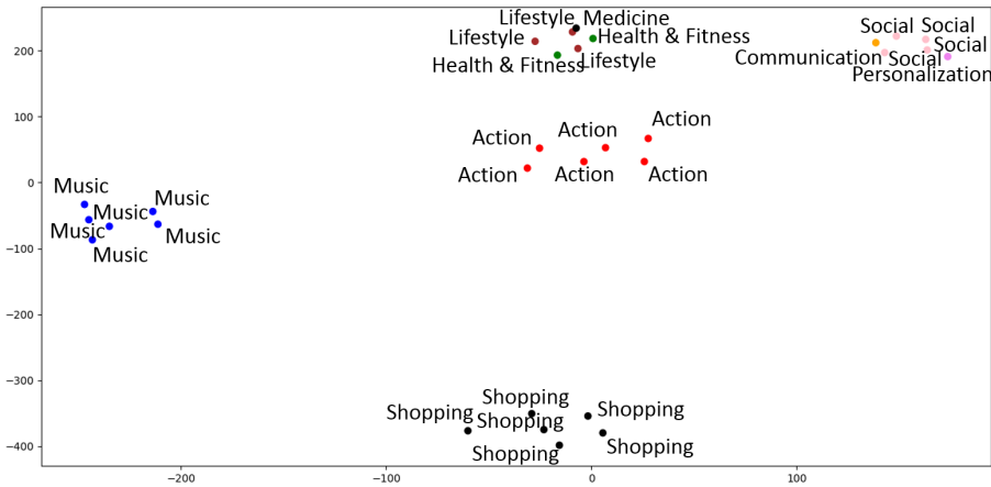
Fig. 2. t-SNE projection for applications and their categories given in Table 2

vector and the application category as the output variable. Trained application classifier can act as black box to predict the category of any new application. On the other hand, clustering is an unsupervised approach based on just the feature vectors. It can be used for grouping similar applications together, which has many practical use-cases like folder creation for grouping similar apps in mobile.