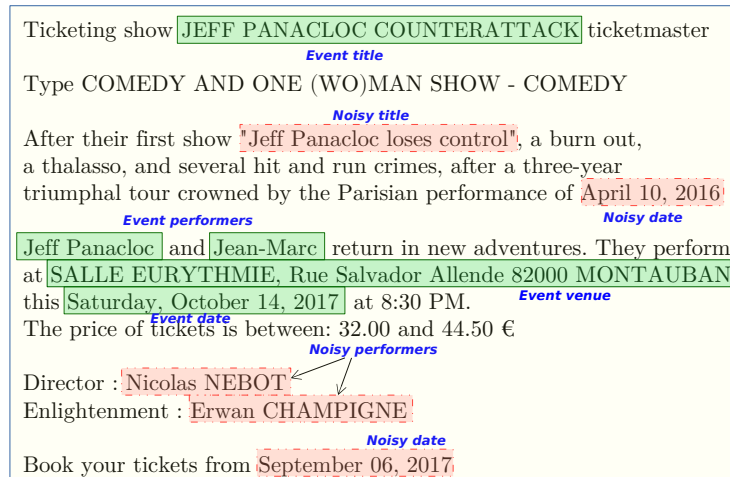
Figure 1. Excerpt of text describing an event

Ultimately, a complex NE’s property is said to be noisy if the analysed text contains several candidate phrases that can match this targeted property. When this issue arises, the extraction context is referred to as noisy. This paper will focus on this issue.