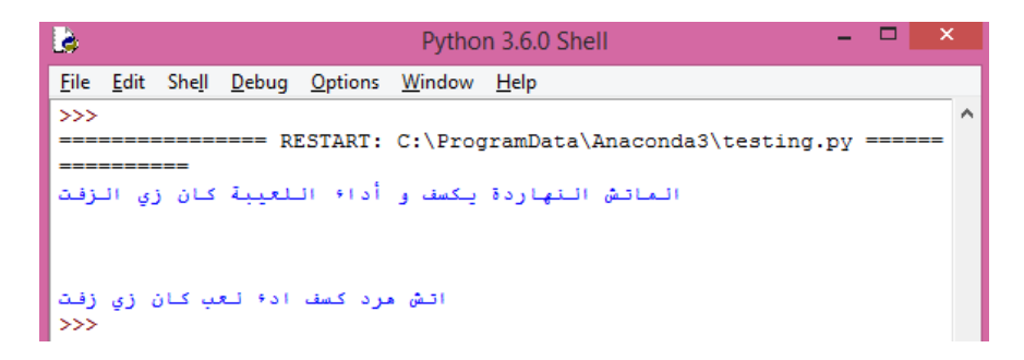
Fig. 2. Arabic text before (top) and after (bottom) preprocessing.

Now that the data set is an array of separated stemmed words, the next step would be to remove the stop words. NLTK libraries and modules do not contain Arabic stop words, so a list of Arabic stop words was manually added and used to filter out those words from the data set. Afterwards, all words are stored as tuples having two pieces of data. The first part is the stemmed word itself and the second is its polarity, positive or negative. This data is then pickled. Pickling and unpickling are performed using the pickle Python module, to pickle means to convert a Python object into a stream of bytes, and to unpickle is the opposite process. The following figure shows an example of a simple sentence labeled as negative, and written in Egyptian dialectal Arabic, before and after being preprocessed.