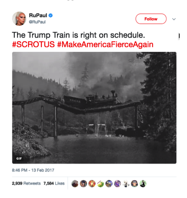
Fig. 3. Sample Tweet of positive sentiment

A Decision-Level Approach to Multimodal Sentiment Analysis