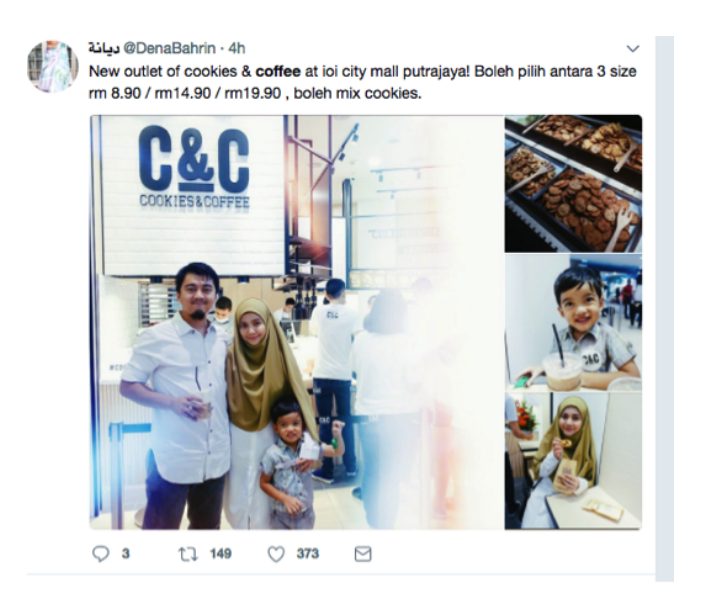
Fig. 1. Sample Tweet of positive sentiment

There are many practical applications of automated sentiment analysis in use today [7]. To just look at one example, as more and more product reviews are conducted through video, the market is more interested in learning opinions expressed through this medium than simply based on textual reviews. Therefore, marketing teams worldwide are looking at solutions where sentiment is more accurately tracked in relation to the use of their particular product or service. But the automation of SA is challenging when limiting your analysis to text alone. As can be seen in the image 2, the text is neutral in terms of sentiment, but it is clear from the images that the sentiment is positive simply by the smiling faces that are included with the tweet. This is a straight forward and simple, but powerful example of how images can enrich the sentiment that we can receive from tweets.